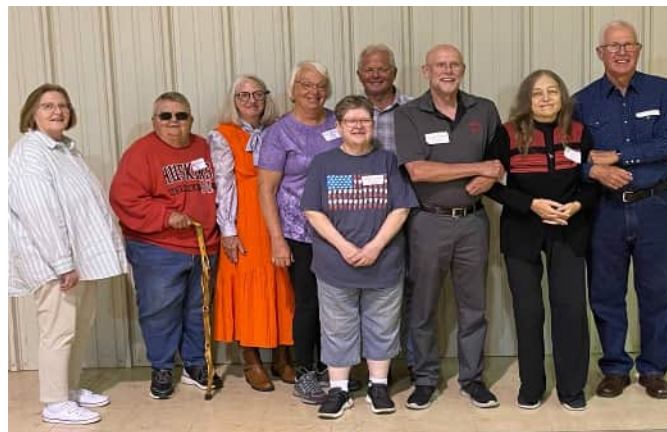
Above: Class of 1974